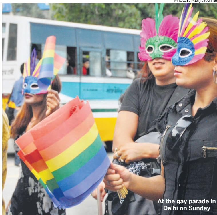
At the gay parade in Delhi on Sunday