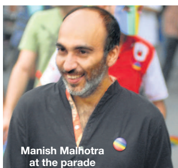
Manish Malhotra at the parade

In December 2002, a gay advocacy group in India filed a Public Interest Litigation (PIL) to repeal this section in the Delhi High Court. Tomorrow, the High Court will begin hearings on this petition by the gay rights group.